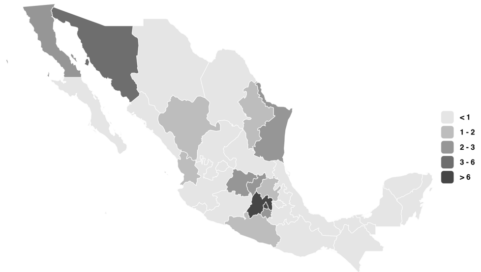
Fig. 2 Map from the origin of the included interventions

or dietary component. Some studies (17; 58.6%) included a PA component, and less (13; 44.8%) included behavioural or physiological components. Few studies (6; 20.7%) considered environmental or setting changes (e.g., modifications to the school food stores or improving the school's infrastructure) (Table 1). Only Costa-Urrutia et al. (2019), Safdie et al. (2013a, b) and Levy et al. (2012a, b) included all the components considered in this review (i.e. considered in the studies a nutritional, PA, behavioural and an environmental change). The studies' duration varied, ranging from 2 days to 3 school years. The frequency and intensity of the interventions (calculated from the reported data) also varied from 2 to 200 sessions with different intensities (Table 1). Further details on the components and characteristics of each study are provided in Supplementary Information 1.